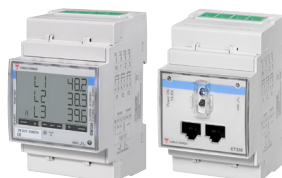
EM330 / EM340 / ET330

The EM330 and the EM340 energy analyzers (respectively by 5 AAC CTs and 65 AAC direct) and the ET330 energy transducer are designed for active energy metering and for cost allocation. Housing for DIN-rail mounting. The transducer is provided with RS485 Modbus port, while the analyzers come with either communication or pulse output.